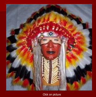
Lived in the mountains near the Rio Grande River

Got their food by farming-ate dried corn, squash and beans